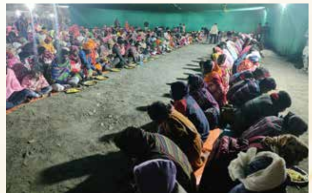
Approx. 5000 families and villagers being given lunch and dinner.