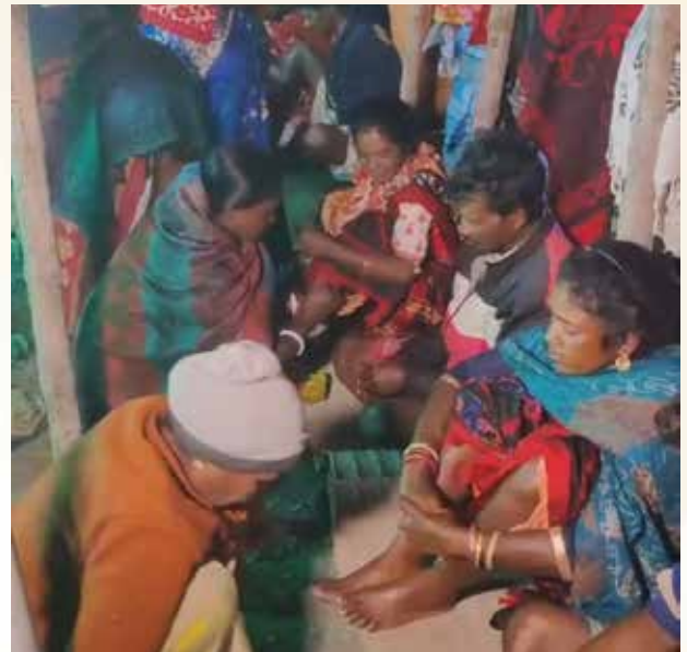
Haldi Ceremony: Haldi being applied to the couples an evening before the marriage.

These collective marriage ceremonies help couples live with dignity and gain full acceptance within society. They not only preserve traditional customs but also protect families from social discrimination and divisive influences such as religious conversion.